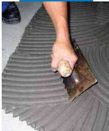
FIXING OF TILES Apply the adhesive onto the prepared substrate using a notched trowel. Do not spread more than 1m 2 at a time.