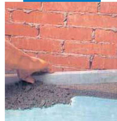
Applying cement screed modified with Planicrete SP