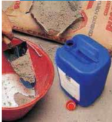
Mixing cement mortar with Planicrete SP for tile fixing