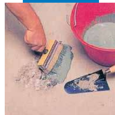
Floor patching: application of slurry