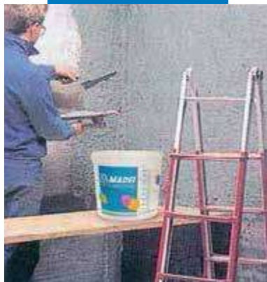
Wall render admixed with Planicrete SP