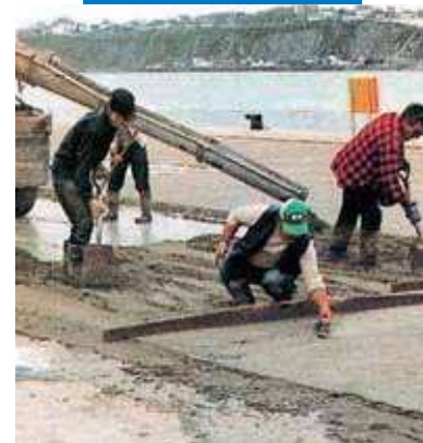
Exterior flooring with concrete admixed with Planicrete SP .