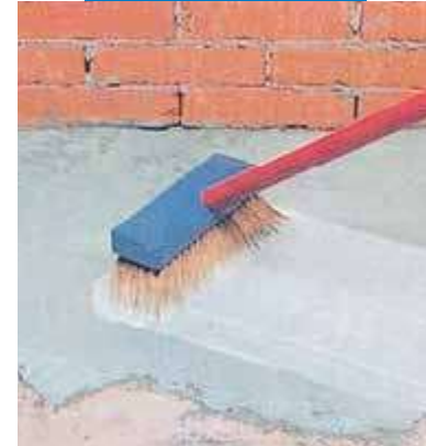
Applying cement slurry modified with Planicrete SP