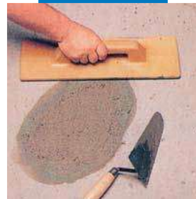
Floor patching: final smoothing