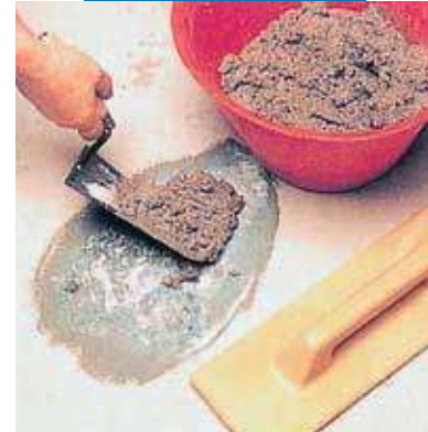
Floor patching: application of mortar

Tools and hands can be cleaned with water before the mix dries. Cleaning is very difficult after the mix has dried; solvents, such as white spirit, may be helpful.