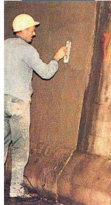
Cement plaster with Planicrete SP .

N.B. Although the technical data and recommendations contained in this product report correspond to the best of our knowledge and experience, all the above information must, in every case, be taken as merely indicative and subject to confirmation after long-term practical applications. For this reason, anyone who intends to use the product must ensure beforehand that it is suitable for the envisaged application. In every case, the user alone is fully responsible for any consequences deriving from use of the product.